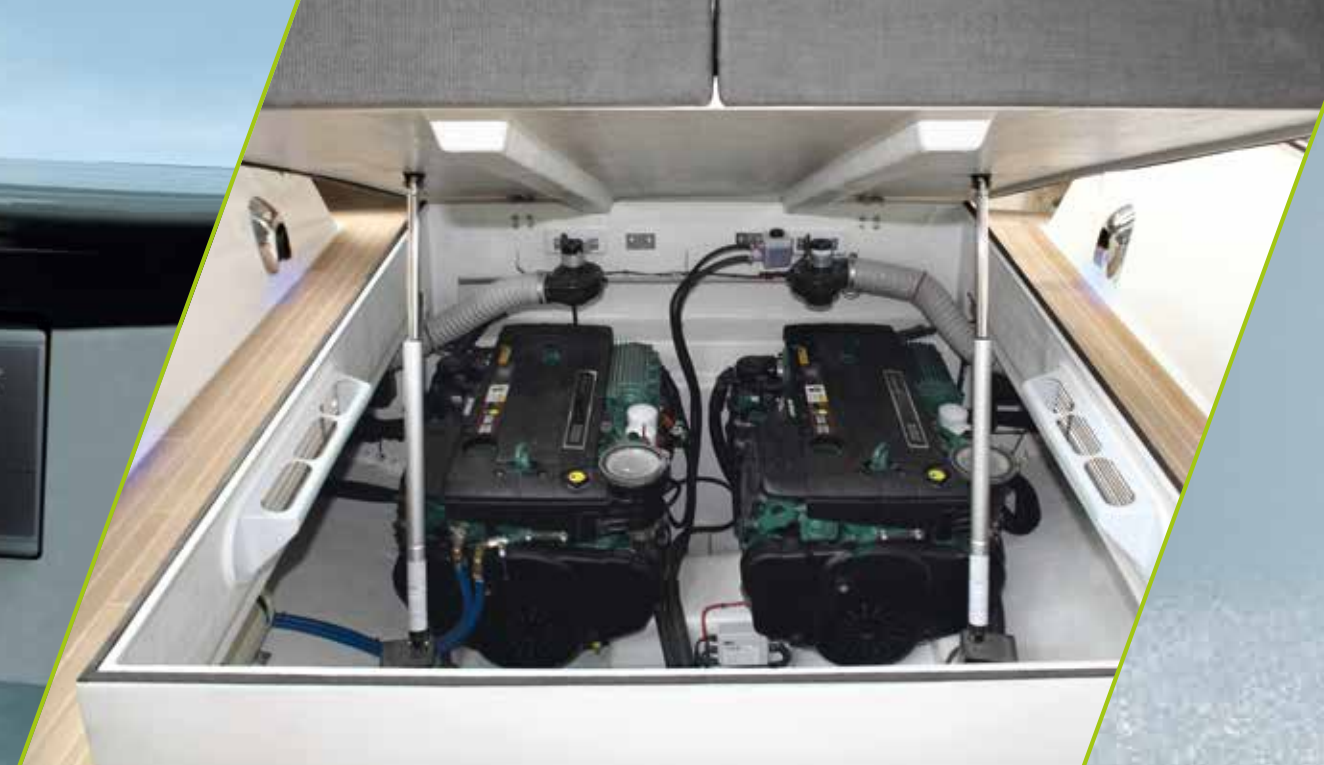
power for propulsion: two Volvo diesel engines with 260 hp or 300 hp