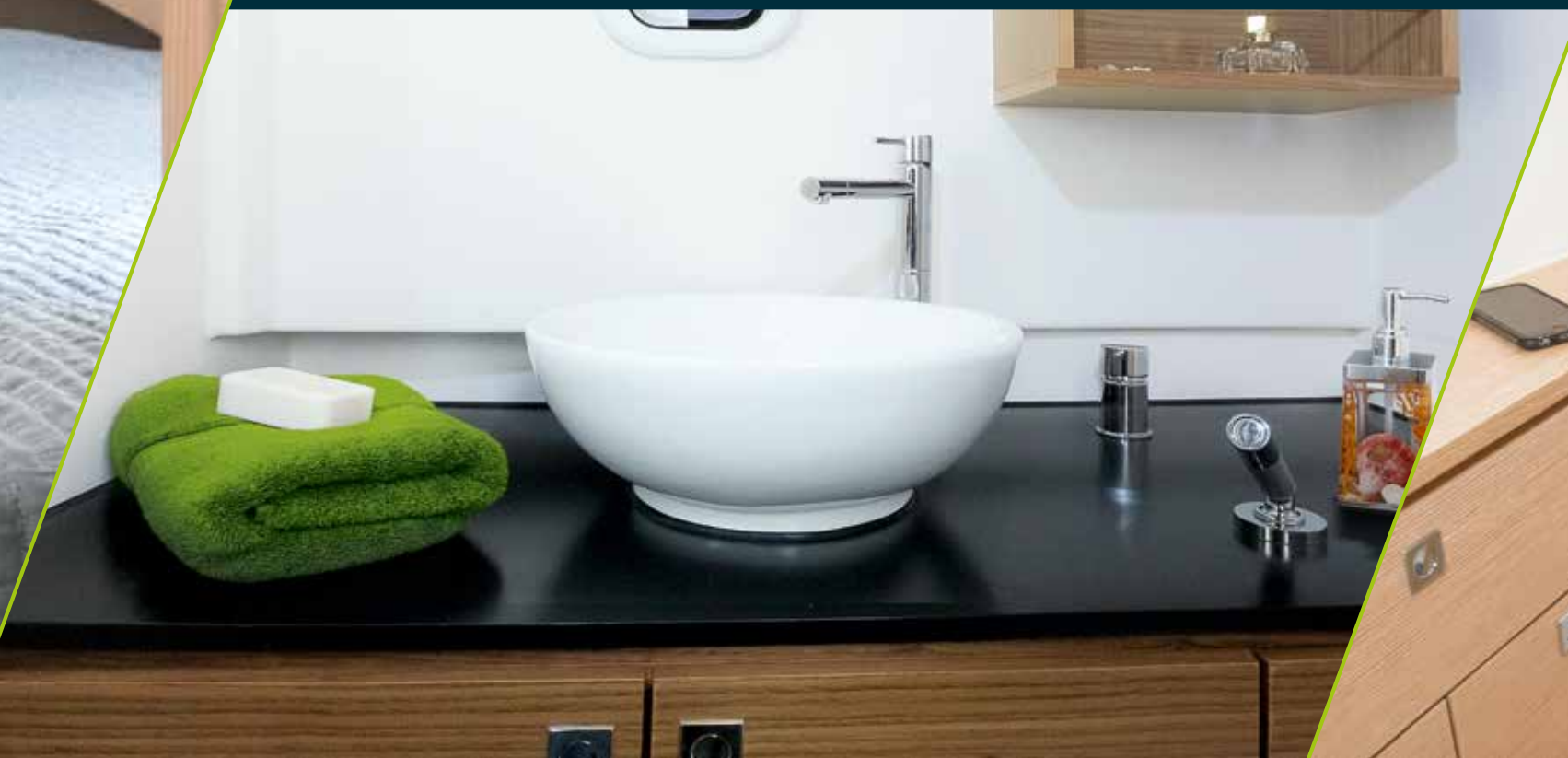
for the well-being of all onboard - the bathroom with electric toilet