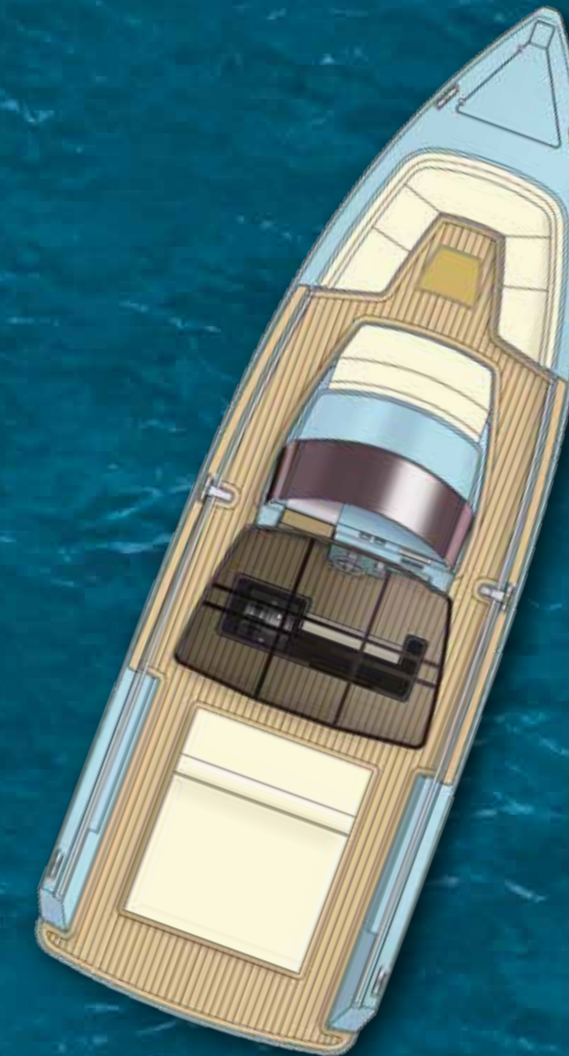
main deck option with galley