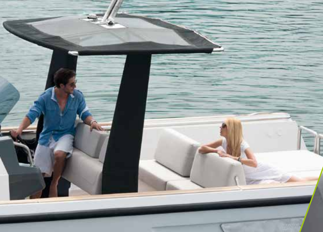
spacious deck: for family and friends