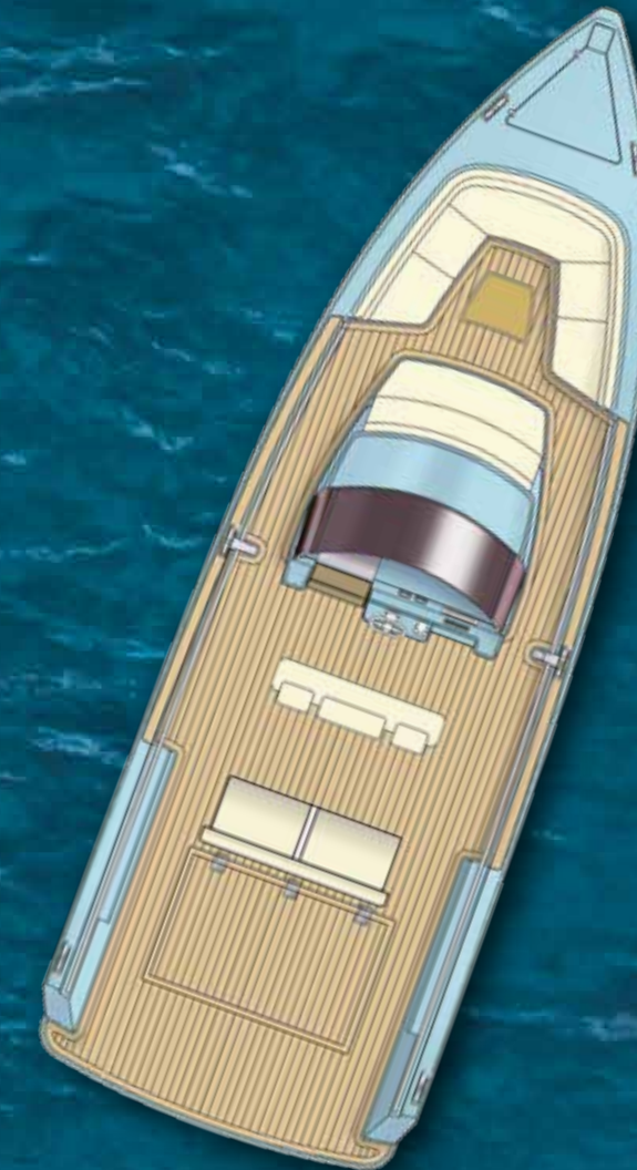
main deck standard