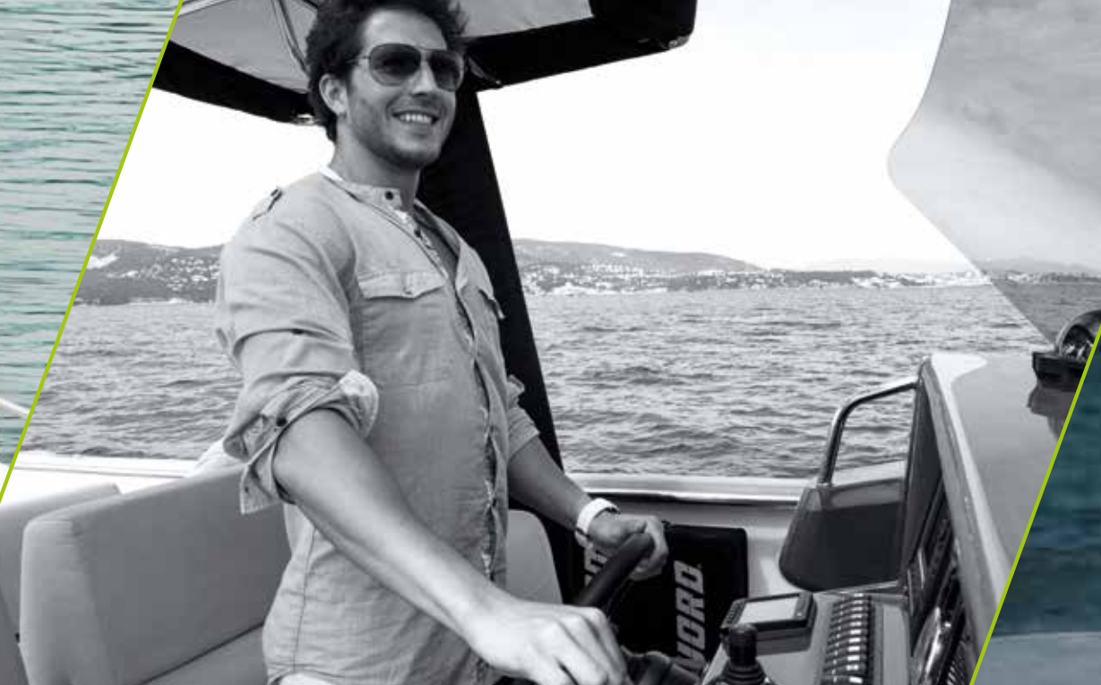
easy to use: the electric anchor